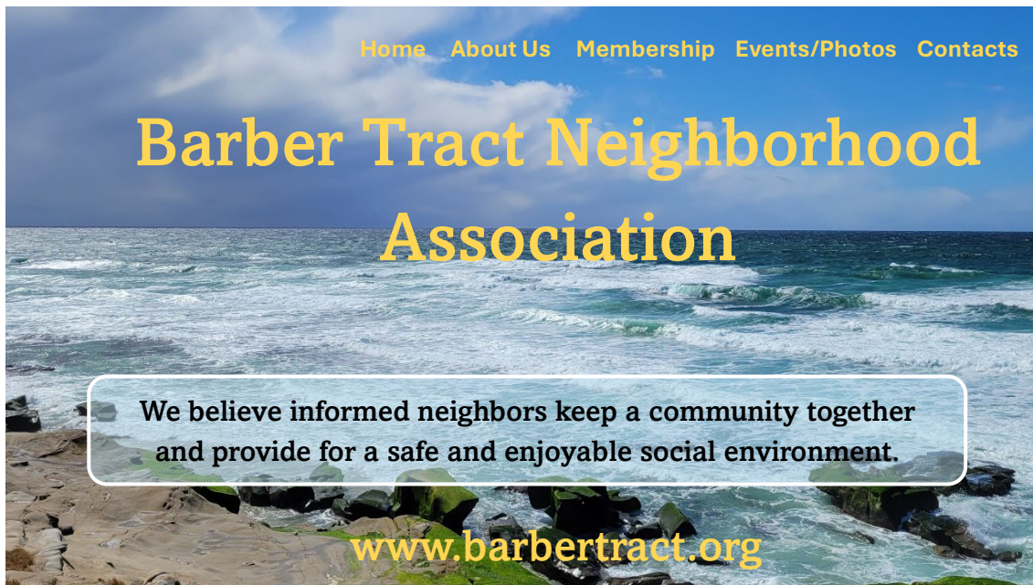
Sample/Draft of a potential new home page

Both barbertract.com and barbertract.org will remain up until at least November 26, 2025. Following that, we will only have barbertract.org available going forward.